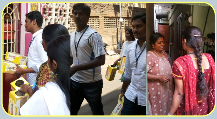
On the occasion of "World Sparrows Day"

On this observance, the staff and students of MBA department formed a special group "NEST" and conducted public awareness campaign in and around KALADIPET, Tiruvotriyur, Chennai on Saturday 29.03.2014.A sparrow nest box was provided to all houses.