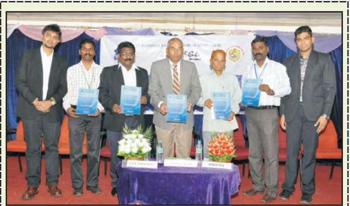
The Director (VEC), Vice Principal, Chief Guest, HOD-EEE & Coordinators on the release of souvenir of the National Level Technical Symposium EMERGE '2k15