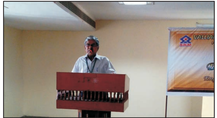
Burke Club Activity

The Burke Club organized two sessions of its oratorical competitions on 24 th August 2015 and 2015. The students from the first year participated actively and bagged many