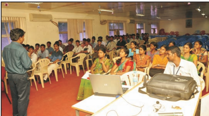
The Chief Guest briefing about Supervisory Control & Das

A one day Special Lecture was organized as part of Renewable Energy Club activity on the 'Recent Trends in