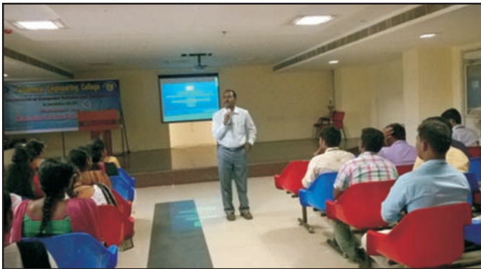
The Professor & Head, Department of Civil Engineering briefing students on the Special Online Lecture