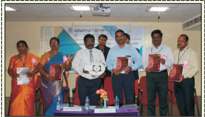
Release of Souvenir on the occasion of National Level Technical Symposium 'XploITs2K15 v2.0:Colosium 2K15 v2.0'