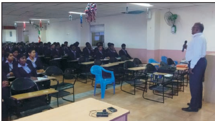
Guest Lecture on Social Dumping