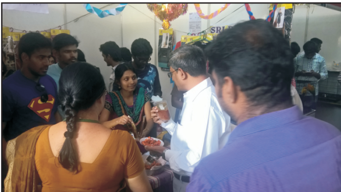
The Principal's chat with MBA students during the event Bazaar 2015