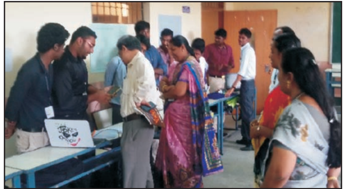
A student explaining his Mini-Project to the Principal