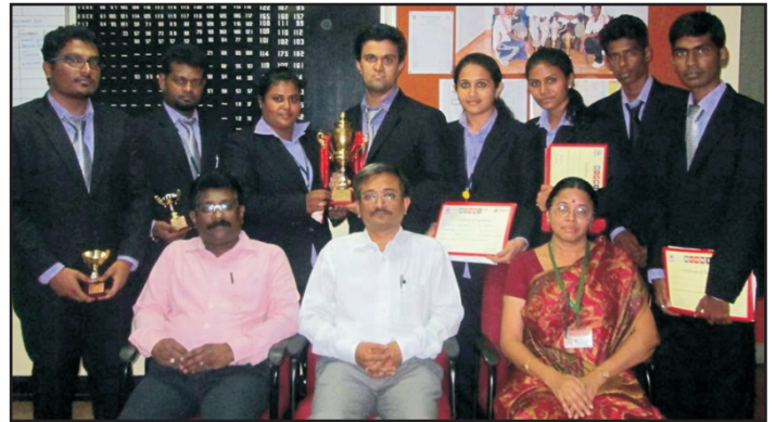
Cash award winners with the Principal, Vice Principal & Hod, MBA

Principal Consultant from Mayur Consultant and Learning Services, Bangalore.