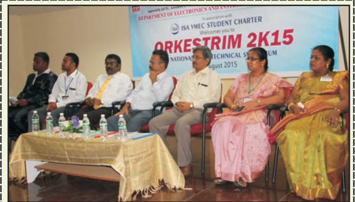
On the dais the Principal, Vice Principal, Chief Guest, HOD-EIE & Coordinators on the inauguration of National Level Technical Symposium ORKESTRIM 2K15