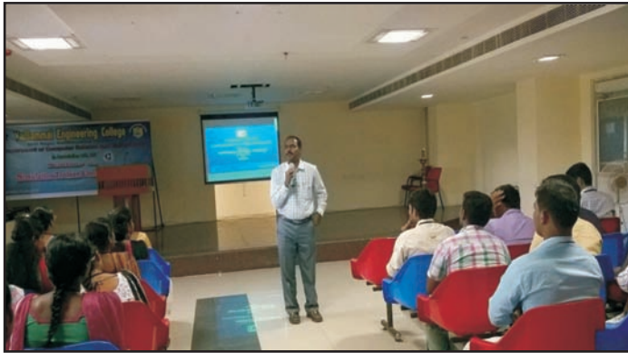
A Special Webinar