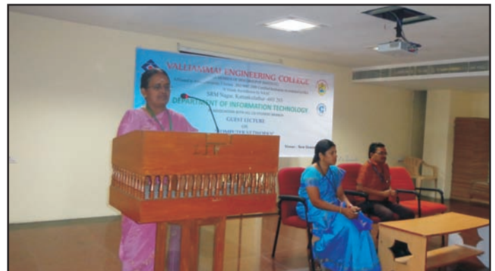
HOD-IT welcoming the Chief Guest on a one day Seminar on 'Computer Networks'