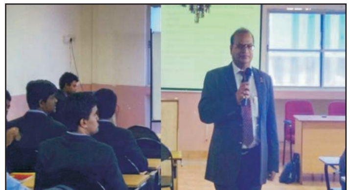
Guest Lecture on Role of Debt Market in Indian Economy

A Guest Lecture was conducted on 22.09.2015 for the Final Year MBA Students on the 'Role of Debt Market in Indian Economy'. The lecture was delivered by PMJF