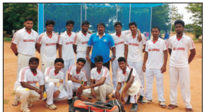
College Cricket Team secured Second Place in Anna University Zone IV