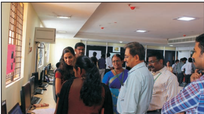
Student explains their Mini Project to the Principal, Vice Principal