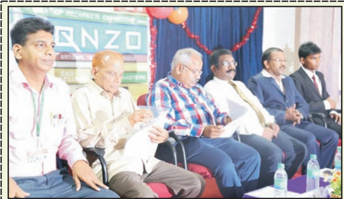
Dignitaries at MEQNZO