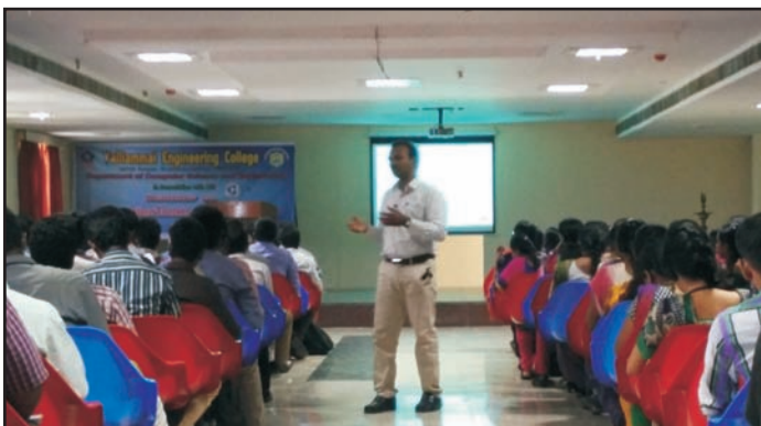
The Chief Guest briefing on a Guest Lecture to the students on Embedded Control Systems

The ISA VMEC student charter organized a Seminar