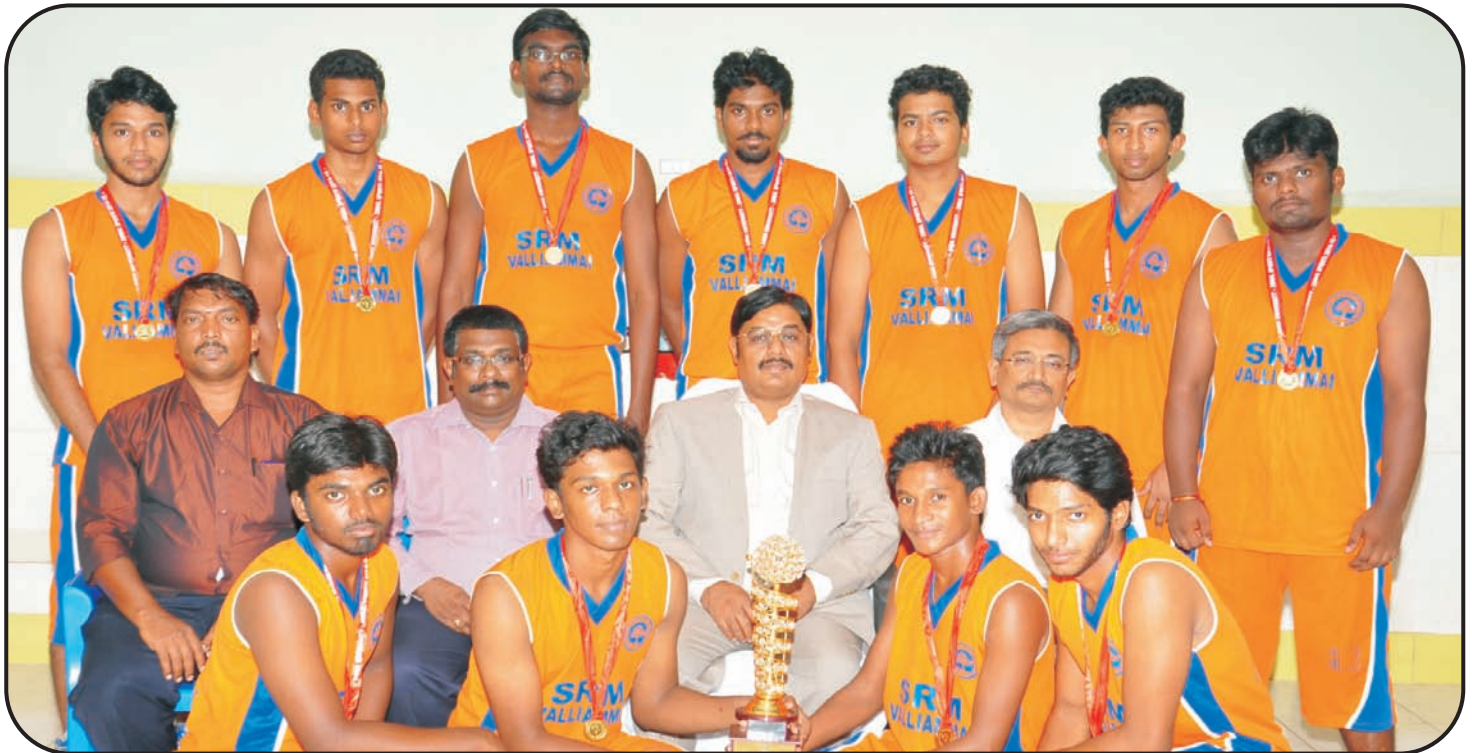
Anna University Zone - IV, Basket Ball (Men) Winners with Hon'ble Chairman, SRM Group

Anna University Zone - IV Ball Badminton, Men's 1 st Place Tournament organized by Sri Andal Azhagar College of Engineering. It is the Fifth continuous win.