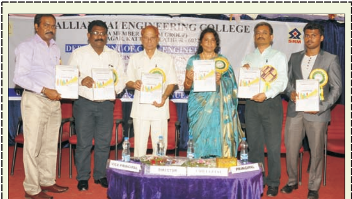
Release of Souvenir in the event of CONSTRUO '15