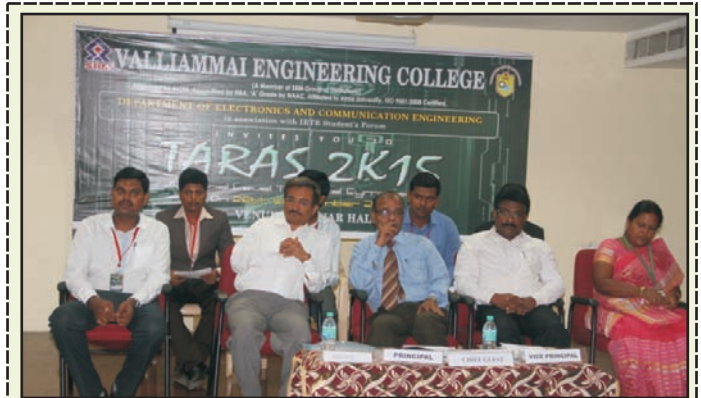
On the dias the Principal, Vice Principal, Chief Guest, HOD-ECE & Coordinators on the inauguration of National Level Seminar TARAS 2K15

A National Level Technical Symposium 'TARAS 2K15' was organized by the Dept. of ECE on 26.09.2015.