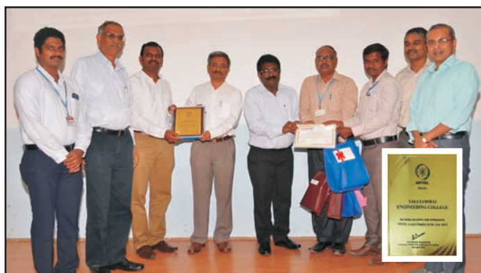
On the occasion of receiving NPTEL Award and Certificate (inside : NPTEL Award)

Under the auspices of the National Programme on Technology Enhanced Learning (NPTEL), a project funded by the Ministry of Human Resource Development (MHRD), our VEC provides e-learning through online Web and Video courses in Engineering, Sciences, Technology, Management and Humanities.