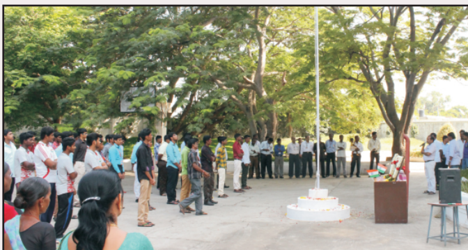
On the occasion of 69th Independence Day Celebration at VEC