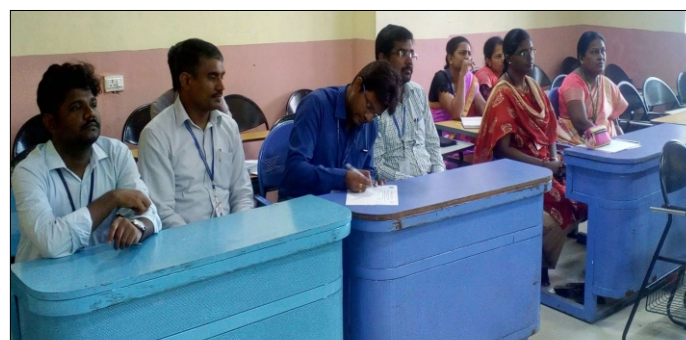
FDP on 'Electro Magnetic Field' held on 7 th to 9 th November 2016

Capgemini Software Solutions conducted their Campus Recruitment on 13 th & 14 th Oct. 2016 with a salary package of 3.5 Lakh per annum. Eventually, 12 Students got placed in this Software Solutions.