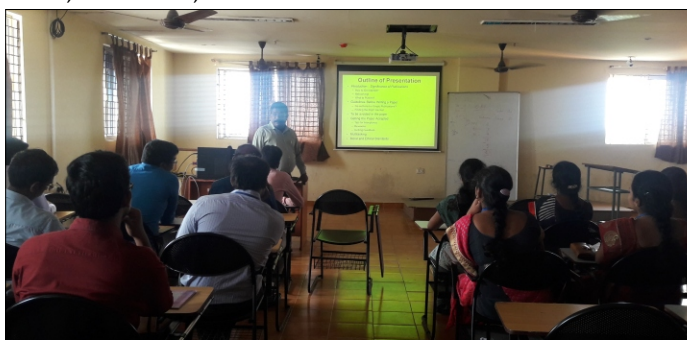
FDP organized for the newly joined Faculties on 28 th & 29 th Nov. 2016.