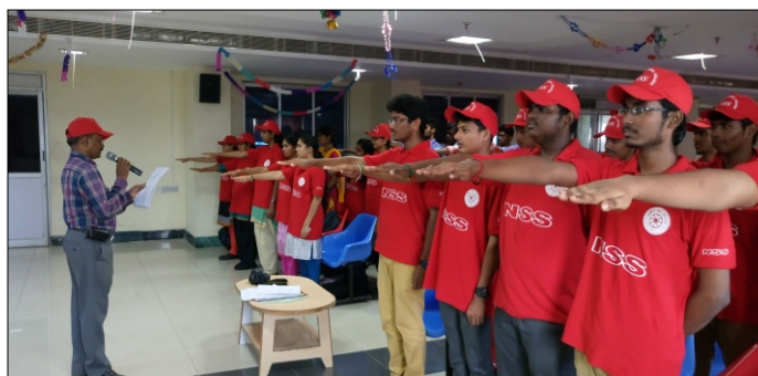
Rashtriya Ekta Saptah - remembrance of Sardar Vallabhbhai Patel

Freshers' Orientation Programme for the newly joined NSS Volunteers was conducted on 3 rd October 2016.