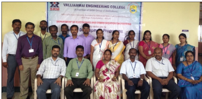
FDP - Multimedia Compression and Communication