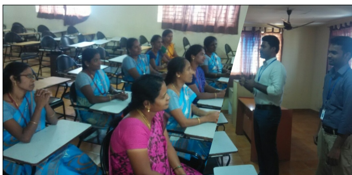
Staff Development Programme for all Non-teaching Staff held on 23 rd Dec. 2016