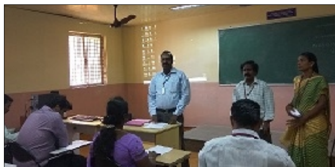
SDTP Programming in JAVA