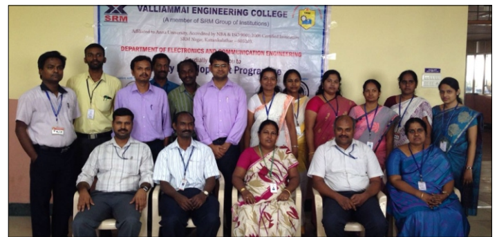
Beneficiaries of the FDP organised by the Department