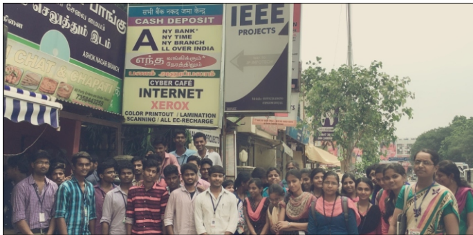
Industrial Visit to 'JP INFOTECH, Software Development & Research Division, Chennai' on 4th October 2016.

defined Networks-SDNC 2016' conducted on 18 th & 19 th October 2016, by the Dept of CSE, Faculty of Engineering and Technology, SRM University.