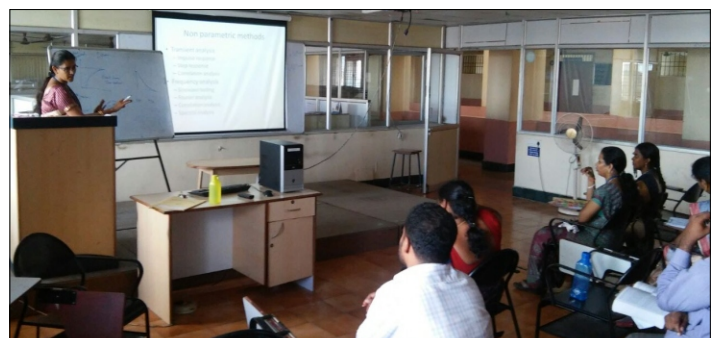
FDP on 'Computer Control of Process' held on 15 th & 16 th November 2016