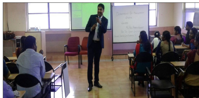
Guest Lecture on 'The Business Strategies with reference to Service Industry' held on 14.10.2016