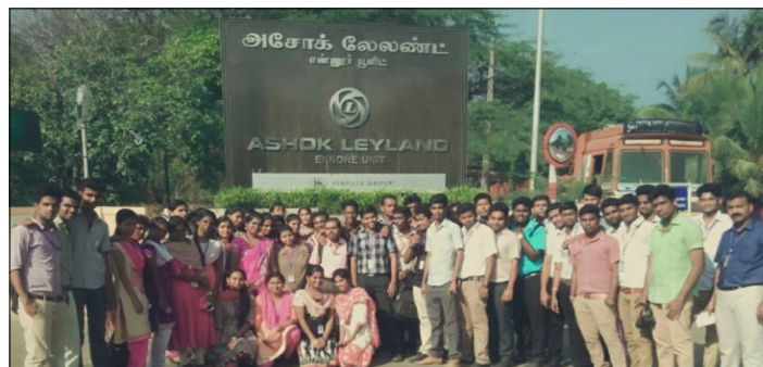
Industrial Visit to Ashok Leyland Ennore Unit on 23 rd November 2016

An industrial visit to Emerald Engineering and Diamond Engineering Chennai Pvt. Ltd was arranged for the First Year students on 17.11.2016.