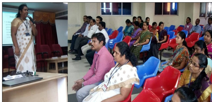
Seminar on '360° Financial Planning' held on 23.12.2016

An industrial visit to Ashok Leyland Ennore Unit was arranged for the First Year students on 23.11.2016.