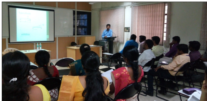
Lecture on 'Fixed Beam'

The Dept of Civil Engineering organized a Faculty Development Programme on the 'Strength of Materials' from 21 st to 22 nd November 2016. The internal expert members of VEC delivered the lectures for all the sessions.