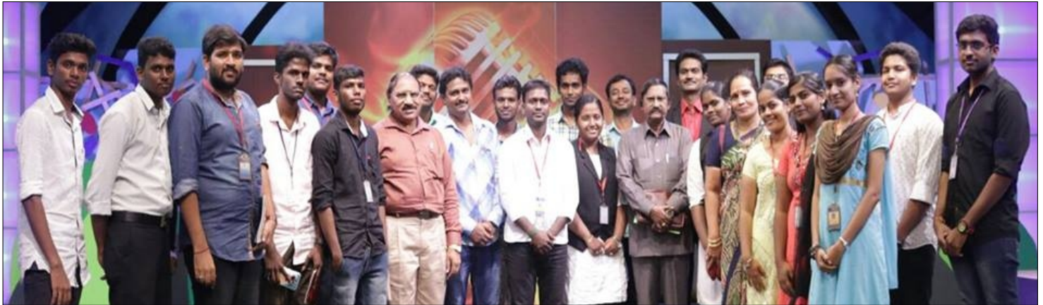
Our College students participated in the program 'Karuthu-Kalam' organized by Pothigai TV on 22.10.2016