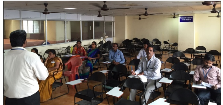
FDP on 'Process Control' held on 17 th & 18 th Nov. 2016

Faculty members of the Dept. of EIE visited the Doordharshan Kendra, Chennai on 02-11-16.