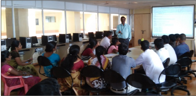
SDP on 'Microsoft Office Suite' held on 30.11.16.