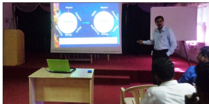
Guest Lecture on 'Functional Materials' 05.10.2016.