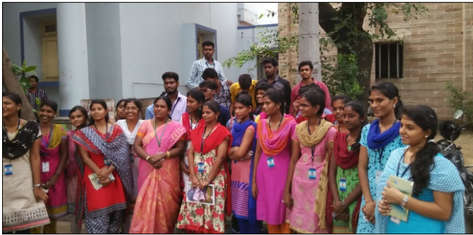
Industrial visit on 'Cognitive Radio and its Applications' to All India Radio Channel, Chennai on 21.10.2016