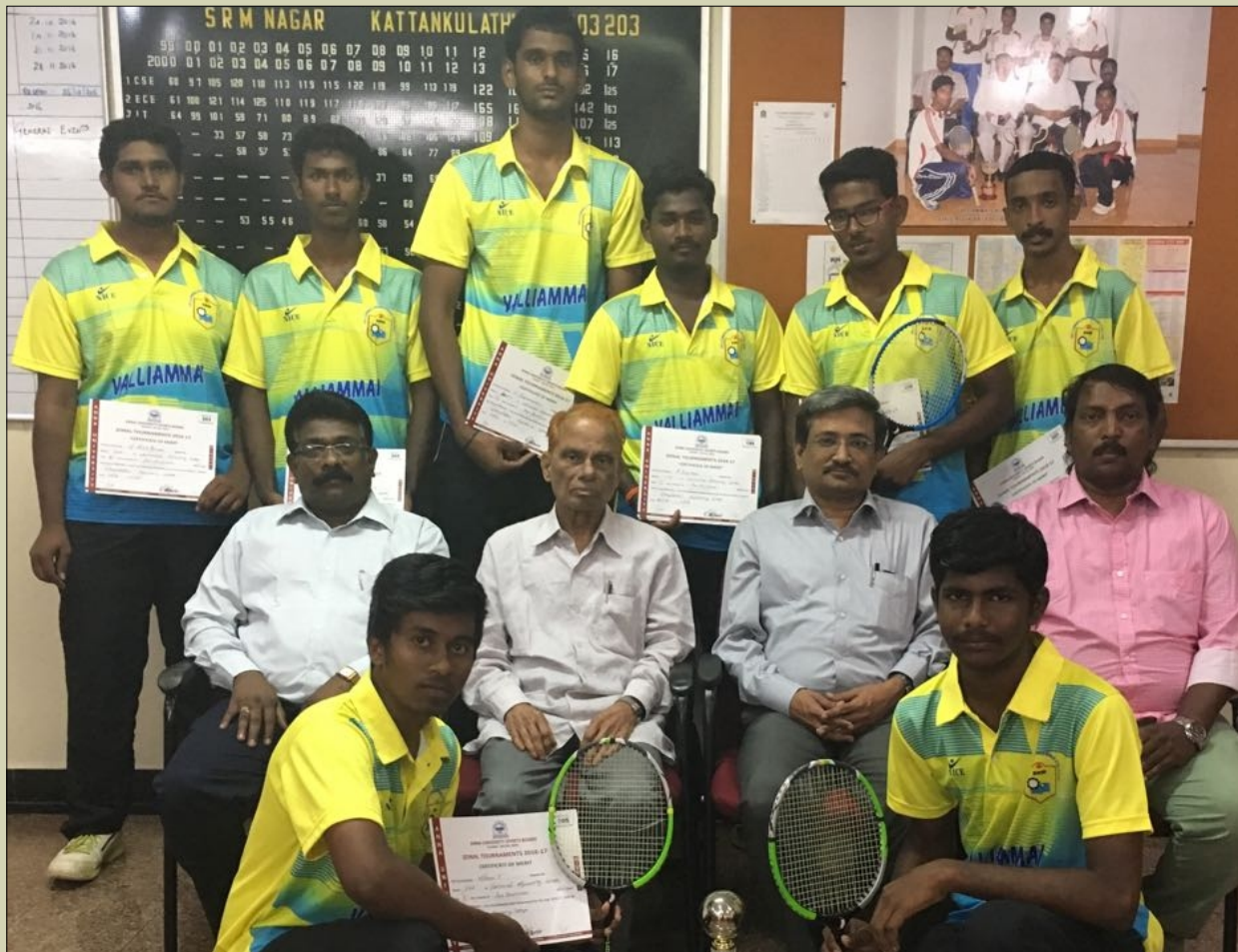
College Ball Badminton Team (Men) secured First Place in Anna University Zone IV Tournament