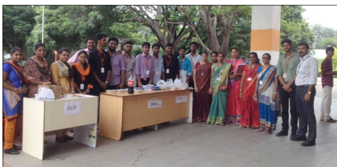
The Dept. organised an M-Fest (Food Festival) on 28 th & 29 th Sept.2016

For developing entrepreneurial skills, the final year students of the Dept. of Management Studies conducted the M-Fest (Food Festival) on 28 th and 29 th Sept.2016.