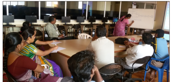
FDP on 'Compiler Design' held on 22 nd & 23 rd November 2016

A one day Industrial Visit to 'Prasad Film Laboratories, Chennai' was organized on 21 st December 2016 for the Staff.