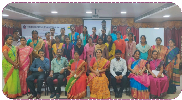
National Seminar on the 'Mathematical Techniques and their Applications'