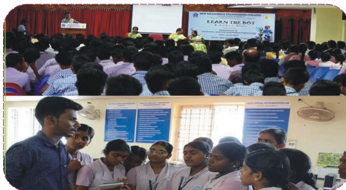
Workshop 'Learn the Bot'

Robotics Club presented an Expo on the Robots prepared by them to the school students.