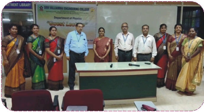
Guest Lecture on 'Nano scale materials for energy applications'