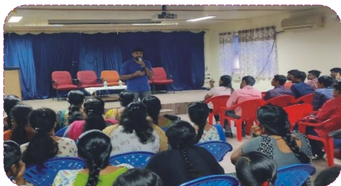
Motivational Talk to second year and third year students

an industrial visit to VMR Elmag Solution Transformer Manufacturers.