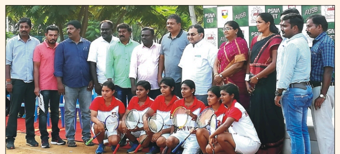
Women Ball Badminton team secured the Fourth Position in Anna University Inter Zonal Ball Badminton Women Tournament

Our Women Ball Badminton team secured the Fourth Position in Anna University Inter Zonal Ball Badminton Women Tournament organized by P.S.N.A. College of Engg. & Tech., Dindigul on 29 th & 30 th December 2019.