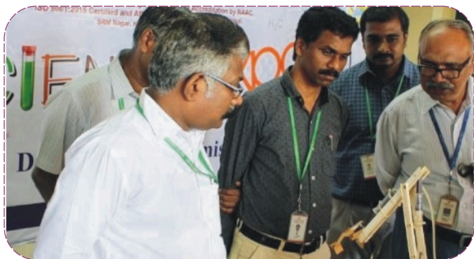
Science Expo 2019

The Department of Chemistry organized the 'Science Expo'19 on 29/11/2019 for school students. Participants