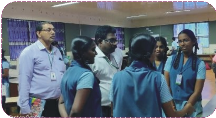
Science Project Expo 'ELECTRA FEST 2k19' for school students of classes 9, 10, 11 & 12

A Science Project Expo 'ELECTRA FEST 2k19' on 10 th October 2019 for school students of classes 9, 10, 11 and 12 was organized. Participants from various schools took part in the event. A total strength of 81 students enthusiastically participated and presented their projects in various domains outlining the theme of Renewable energy sources, Energy efficient drives, Security systems, Automated control systems using sensors and other innovative ideas in Electrical field. The major objective of the programme was to provide a platform and explore the potentials of the students by incorporating engineering ideas.