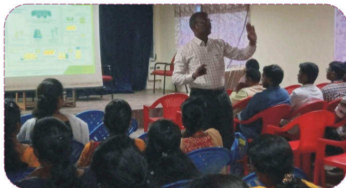
Guest Lecture on 'Renewable Energy Sources'