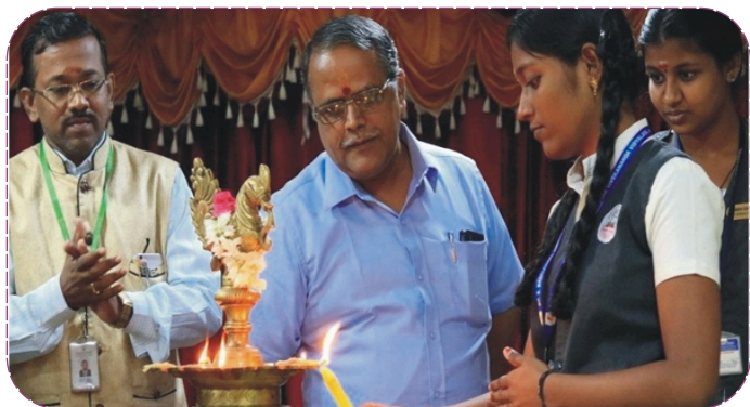
Workshop on 'Aero Modeling Learn; How to Fly' for school students

A four day Workshop on 'Aero Modeling Learn; How to Fly' for school students was conducted on 04.12.2019. SRM VEC SAE Club students and Madras Aero Club Trainers demonstrated the fundamentals of aero modeling and a kit was provided to the participants.