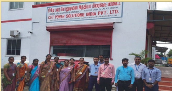
Faculty members from the Departments of EIE, EEE and ECE visited CET Power solutions Pvt. Ltd. Kattupakkam, Chennai-56 on 29th November 2019.