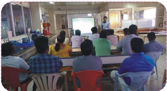
FDP on 'Thermo Structural Analysis'