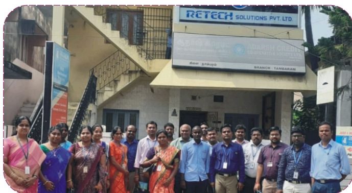
Faculty members Industrial Visit to 'Retech Solutions Pvt Ltd'

The Faculty members of the Dept of ECE, EEE and E&I went on an Industrial Visit to 'Retech Solutions Pvt Ltd', West Tambaram, Chennai on 08.11.2019 to sensitize their knowledge on Product Development such as Engraving Machine, Printing Machine, Printer Filament and Acrylic Laser Cutting.