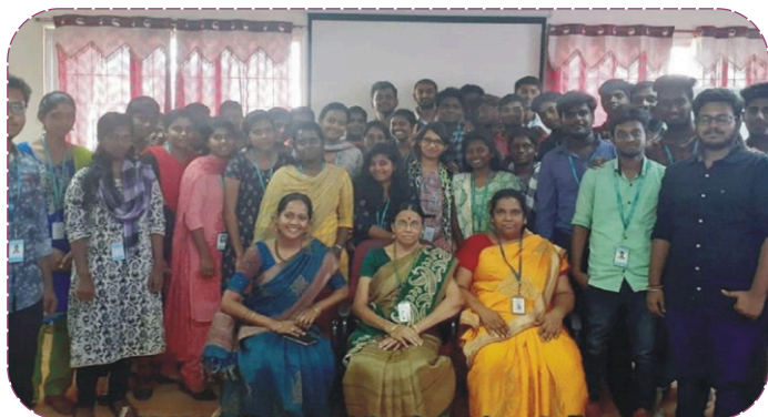
Workshop on 'Entrepreneurship and Innovation as a Career Option'