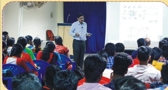
Workshop on 'Chemistry towards Engineering'