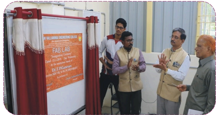
Opening Ceremony of 'FAB Lab'