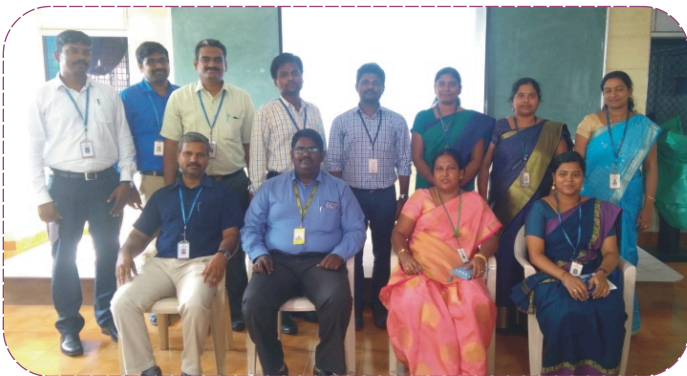
FDP on 'Integrated Circuits for Guided and Unguided Communication'