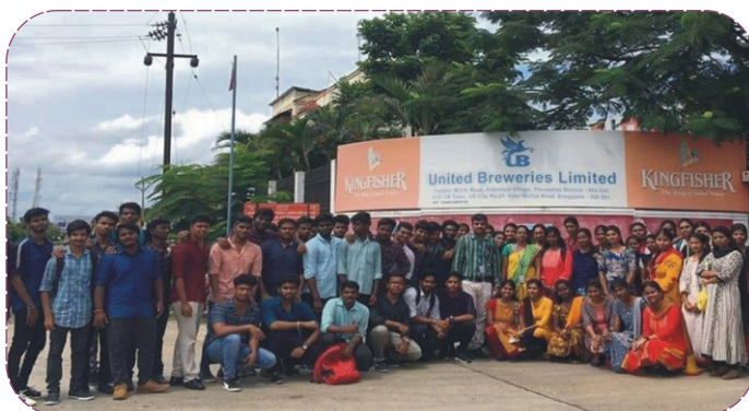
Industrial Visit to M/s. United Breweries Group Ltd

An industrial visit to M/s. United Breweries Group Ltd was organized for the first year MBA students on 31.09.2019. Students had the opportunity to understand the manufacturing process and the quality control measures implemented in the organization in a real time environment.