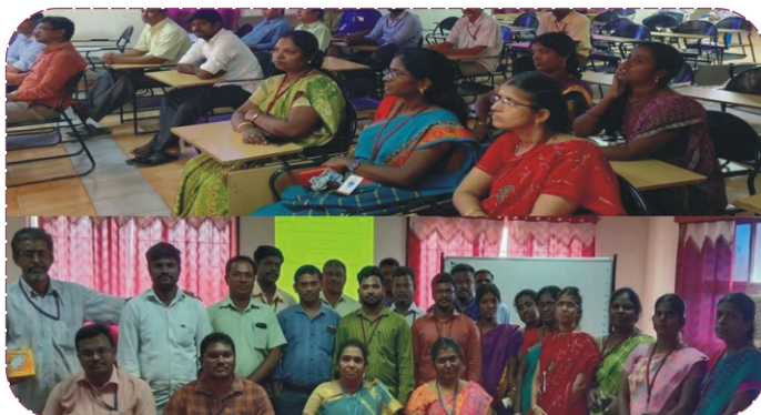
Training Program on 'Behavioural Communication and Information Seeking'

A training program on 'Behavioural Communication and Information Seeking' was organised for the non-teaching staff on 08.11.2019. 20 non teaching staff from various departments of the college participated and benefited from the programme.