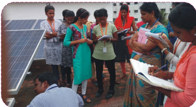
Industrial Vist of Stella Maris College students to SRMVEC

As a part of Industrial visit, forty two students from Stella Maris College and two faculty members visited 30KW Solar Power Plant installed in our college.