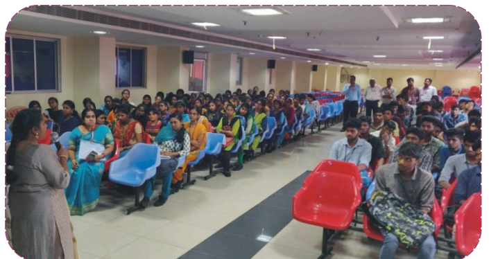
Motivational Talk for the second & third year students