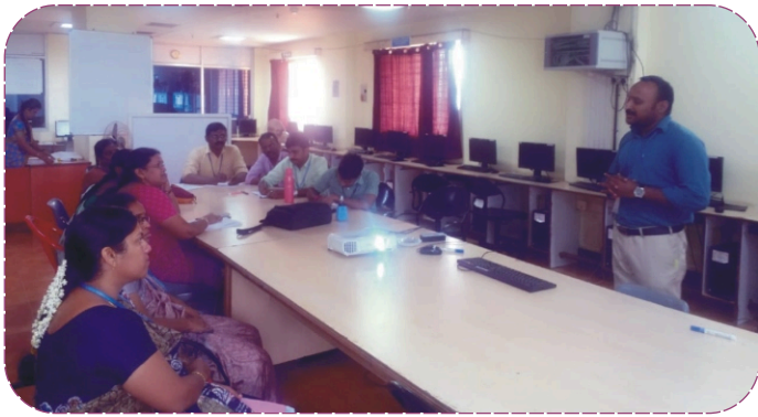
FDP on 'Data to Forensic (D2F)'a