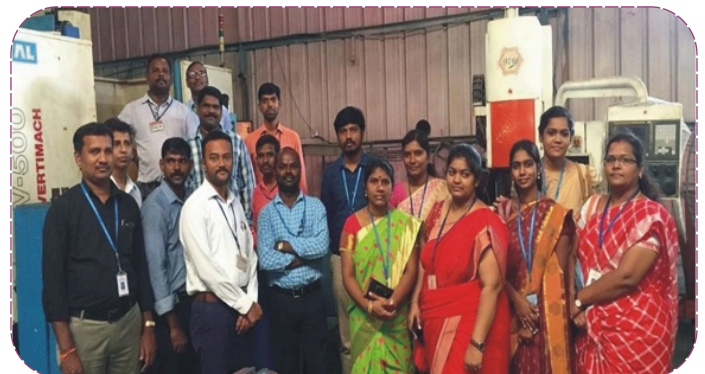
Industrial Visit to 'SS Design System (P) Ltd'

An Industrial visit was arranged for teaching staff of various departments to 'SS Design System (P) Ltd' on 15.11.2019. The main objective of this industrial visit was to enhance the knowledge and to reduce the gap between the Industries and academic institutions. The Chief Supervisor explained CNC milling, CNC drilling and Programmable Logic Controller.