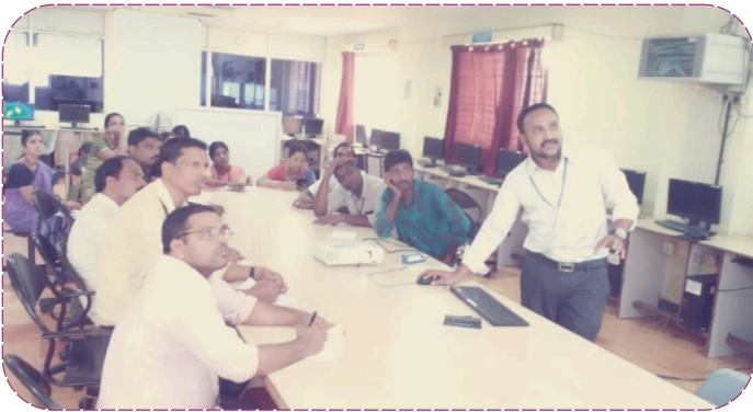
STTP on 'Poster Design'