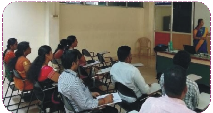
FDP on 'Transmission and Distribution'