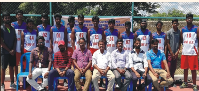
Gold Medal in Anna University Zone – 4 Basketball Men Tournament

The Table Tennis Team got Fourth Position in Anna University Zone - 4 Table Tennis Women Tournament organized by New Prince Bhavani College of Engg. & Tech. on 3 rd October 2019.