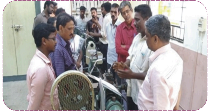
SDP on 'Basic operation in Mechanical Engineering'

A one day skill development programme on the 'Basic operation in Mechanical Engineering' was organised on 13.11.2019 for non-teaching staff members of various departments. The following topics were discussed: Lathe working principle, Welding, Drilling, Milling, Grinding, Shaping operations.