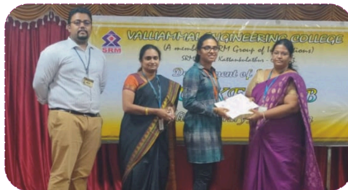
Prize winner of Oratorical Competition of 'Burke Club'

The third session of the Oratorical Competitions under the auspices of 'Burke Club' was held on 4th Nov 2019. The first year students actively participated and exhibited their oratorical skills. The winners were rewarded with prizes and certificates.