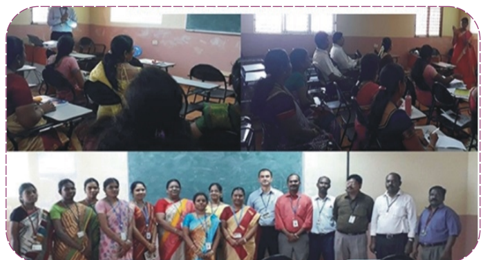
FDP on 'Core Computer Engineering'

A five day Faculty Development Programme on 'Core Computer Engineering' was organized from 11.11.2019 to 15.11.2019.