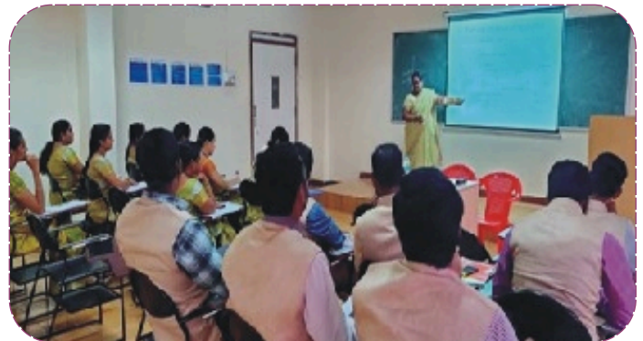
FDP on 'Applied Hydraulic Engineering'

The Department of Civil Engineering in association with the Institution of Engineers(I) and Indian Society for Technical Education organized a five day Faculty Development Programme (FDP) on 'CE 8403 - Applied Hydraulic Engineering' during 02.12.2019 to 06.12.2019. Totally 25 participants from different Engineering colleges participated in Faculty Development Programme. An Industrial visit to the 'Institute of Hydraulics and Hydrology, Poondi' was arranged for the members of the programme.