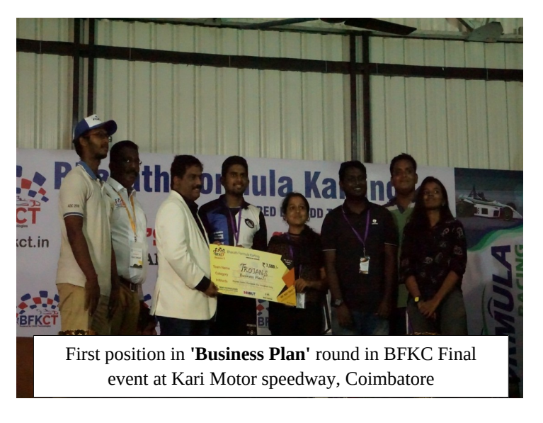
Staff In charge