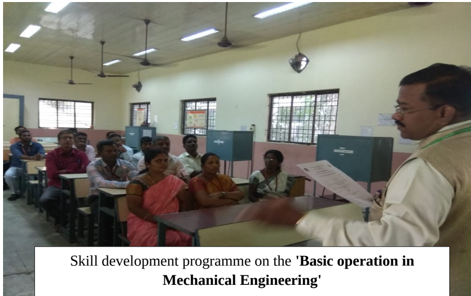
Skill development programme on the ' Basic operation in Mechanical Engineering '

1. A one day skill development programme on the ' Basic operation in Mechanical Engineering ' was organised on 13.11.2019 for non-teaching staff members of various departments. The following topics were discussed: Lathe working principle, Welding, Drilling, Milling, Grinding, Shaping operations.