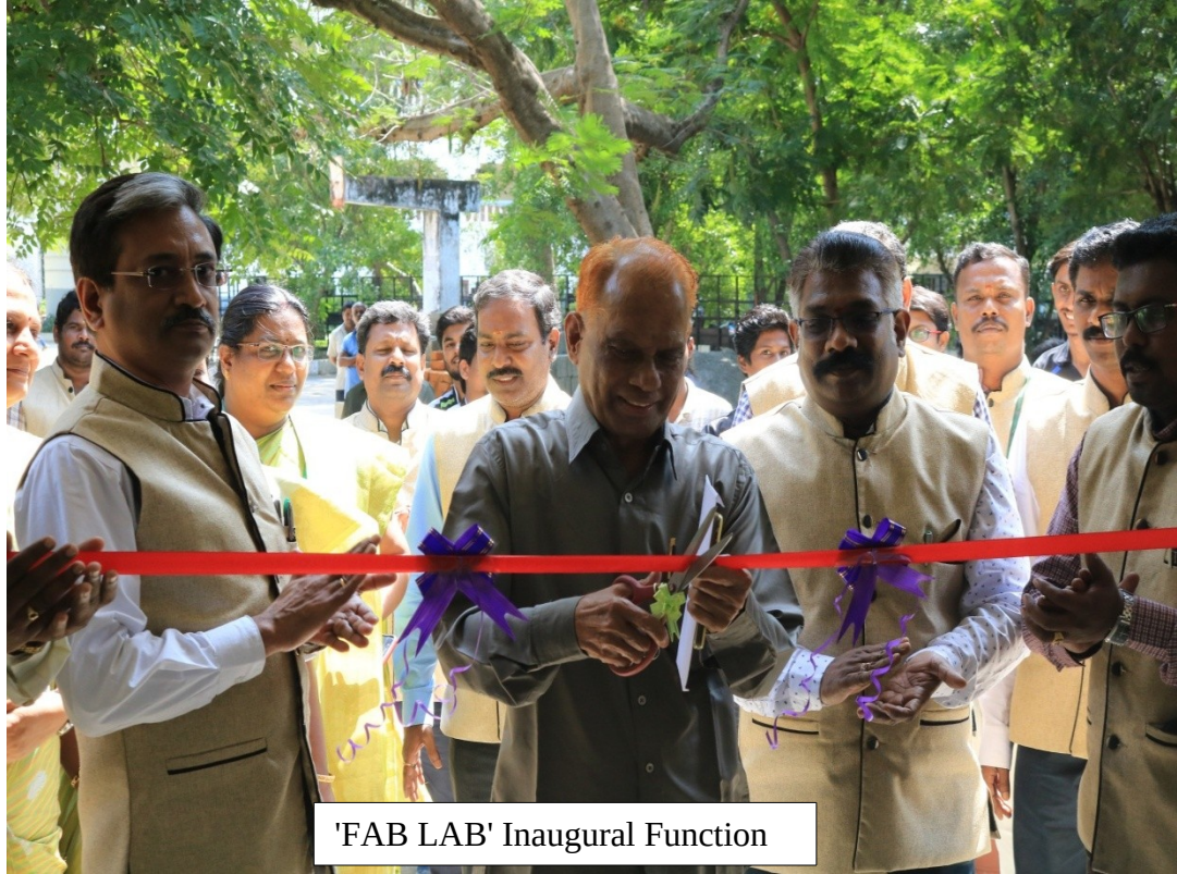
'FAB LAB' Inaugural Function