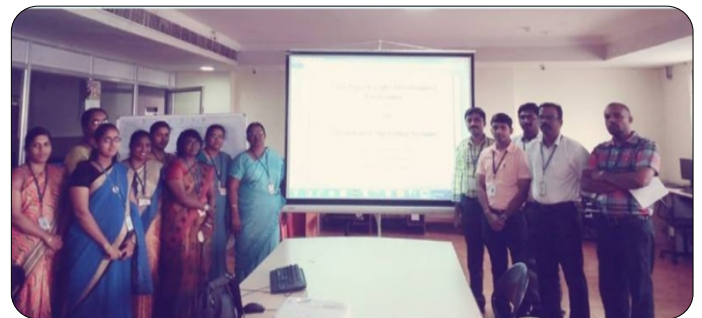
FDP on the 'Distributed Operating Systems'

A six day FDP on the 'Distributed Operating Systems' was organized from 19.11.2018 to 26.11.2018 for the Teaching Staff and our Dept. Faculties were the Resource Persons.