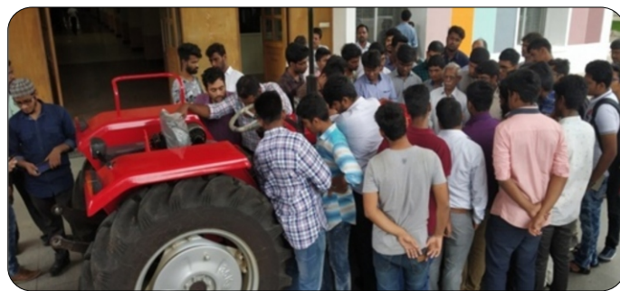
SAEINDIA Southern Section conducted a workshop on 'Tractor Design Competition'