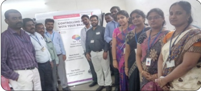
FDP on the 'Linear Integrated Circuits and Applications'