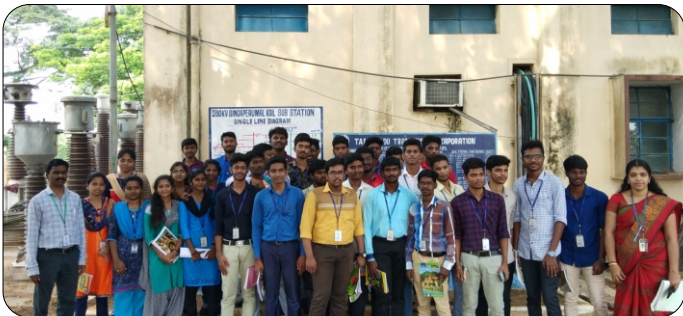
Industrial Visit to 230kV Substation, Singaperumal Koil

The students of IV EEE 1 visited 230kV Substation at Singaperumal Koil on 27.12.2018.