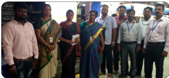
Faculty Members visited M/s. United Industries Plastic Private Limited