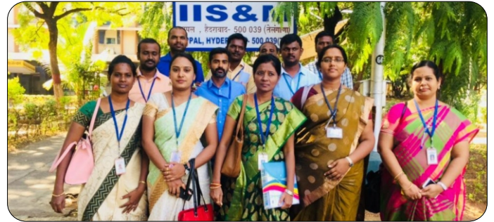
Industrial visit to the Indian Institute of Surveying and Mapping, Uppal, Hyderabad

Faculty members of the Dept went on an industrial visit to the Indian Institute of Surveying and Mapping, Uppal, Hyderabad on 11 th and 12 th Nov. 2018.