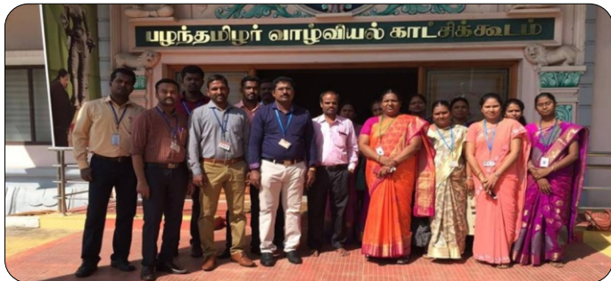
Faculty visit to the Gallery of Pazhanthamizhar Vazhviyal

Paarivendhar Students' Tamil association/VEC organized a one day tour to visit a Gallery of Pazhanthamizhar Vazhviyal located at the International institute of Tamil Studies for the Staff Coordinators of Paarivendar students' Tamil association and for the staff from the other depts of VEC on 06.12.2018.