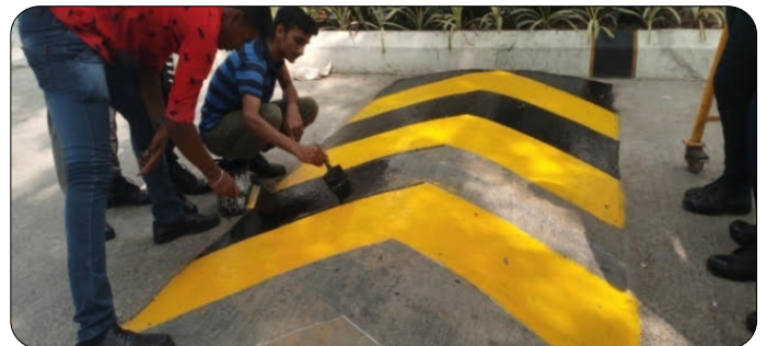
NCC Cadets took part in the 'Painting of Speed Breakers'

Our College NCC Cadets participated in the event of 'Painting of Speed Breakers' in our college under SWACHHTA PAKHWADA event on 08.12.2018.