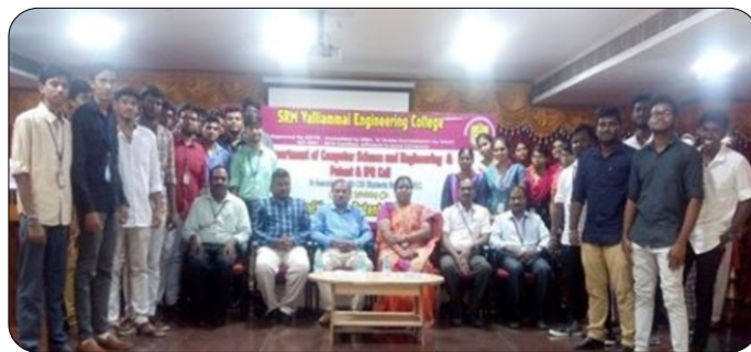
Workshop on 'Drafting for Patent Filing'

A five day Faculty Development Programme on 'Artificial Intelligence, Machine Learning, Cloud Computing and their Applications' was organized from 29.11.2018 to 04.12.2018.