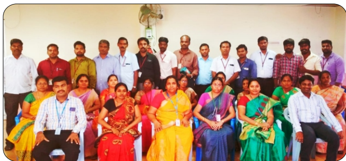
SDP on 'Conflict Management and Confrontation Skills'

A Skill Development Training Programme on 'Conflict Management and Confrontation Skills' was conducted by the Dept. of Management Studies for the Non-Teaching Staff on 14.12.2018. 28 Non-Teaching Staff from different Depts. of the college participated and benefitted.