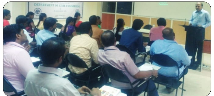
FDP on 'Environmental Engineering II'

The Dept of Civil Engineering in association with the Institution of Engineers (I) organized a five day Faculty Development Programme (FDP) on 'Environmental Engineering II' from 15.11.18 to 20.11.18. Participants from various Engineering colleges participated in the Faculty Development Programme.