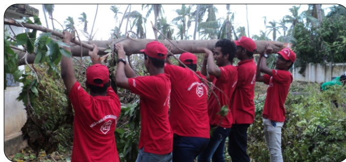
NSS Volunteers removing fallen trees as a part of Gaja Cyclone relief

This team with a new kind of cutting machines, equipments and relief materials proceeded to Trichy from the college campus at Katankulathur on 20.11.2018. After obtaining more relief materials at Trichy from the service organizations, the team went to the cyclone hit areas and started serving continuously from 21.11.2018 to 25.11.2018.