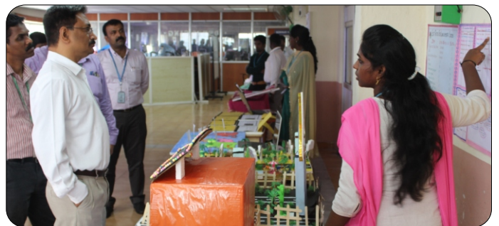
'Management Expo 2018' for the First Year MBA students