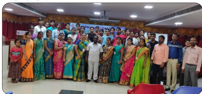
3 rd National Seminar on the 'Recent Trends in Mathematical Sciences and Applications'