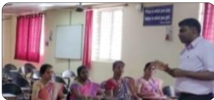
FDP on 'Control of Processes & Concepts of Electrical Machines'

The Dept. in association with the ISA VMEC Student Charter organized a Faculty Development Program at SRM Valliammai Engineering College on 'Control of Processes & Concepts of Electrical Machines' for the following courses - Computer Control of Processes, Process Control and Electrical Machines from 12.11.2018 to 17.11.2018.