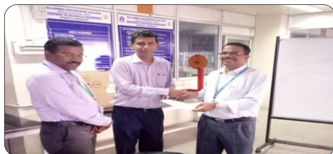
FDP on 'Materials, Design and Analysis for Engineering Applications'