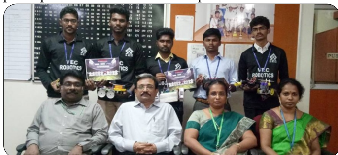
Members of the Centre of Excellence in Robotics and won the Competition ROBOVR2018 in two categories, Robot sport in swimming and Rowing at IIT, Bombay