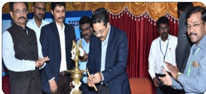
Inauguration of SAE India Southern Section Workshop on 'Aero Design Challenge-2019'