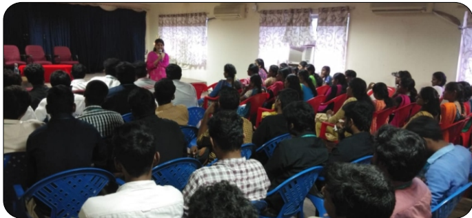
Guest Lecture on 'Self Branding in Job Market'