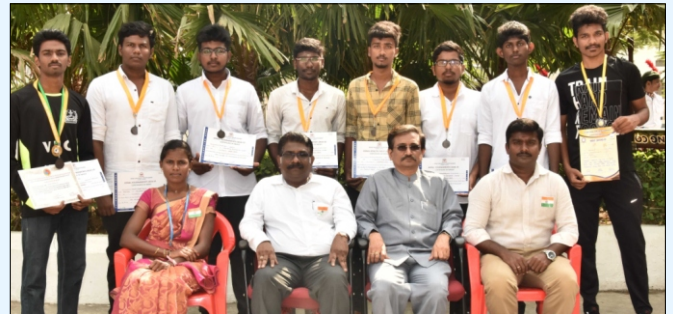
The winners of Chess, Judo, Fencing, Roller Skating with Certificates

Our VEC team won the Bronze Medal in the Anna University Zone - IV Badminton Men's Tournament organized by Sri Sairam Engineering College on 9 th & 10 th October 2018.