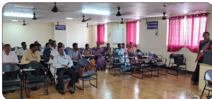
SDP on the 'Role of Emotional Intelligence in Workplace'