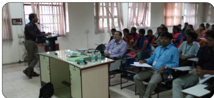
Guest Lecture on the 'Applications of crystalline Materials in Electronics'