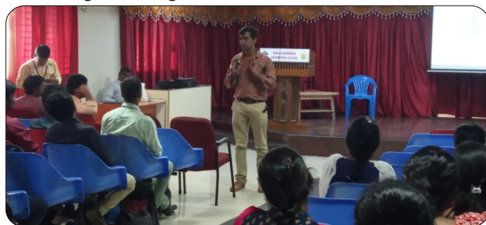
Workshop on the 'Role of Chemistry in Flavors Food Industry'