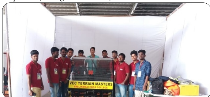
'VEC Terrain Masters' participated in the five-day 'EFFI-CYCLE 2018' held at Lovely Professional University, Punjab

A five-day 'EFFI-CYCLE 2018' final event was held at Lovely Professional University, Punjab from 09.10.2018 to 13.10.2018. Our team 'VEC Terrain Masters' participated and cleared the following rounds: Safety Test, Technical Inspection, Design Evaluation, Brake test.