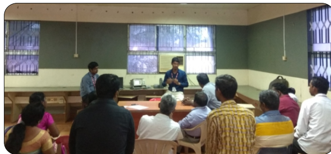
SDP on 'Hands on training on LED fabrication'

Conducted a one day Staff Development Programme on 'Hands on training on LED fabrication' on 30 th November 2018. Mr.Raja. R, Project Head in Embedded-ARM, SANDS was the Resource Person.