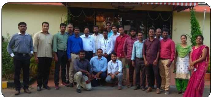
'Faculty Advisor Forum' at the Dept of Automobile Engineering, MIT Chrompet