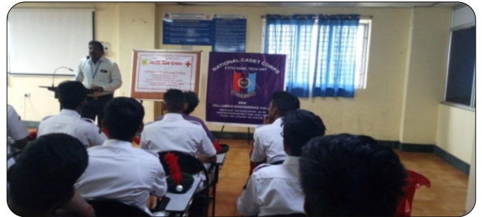
Inauguration of SWACHHTA PAKHWADA event