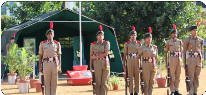
Combined Annual training cum - Thal Sainik Camp

A Combined Annual Training cum - Thal Sainik Camp (TSC) for about 550 National Cadet Corps was conducted at the SRM Valliammai Engineering College from 04.06.2018 to 13.06.2018.