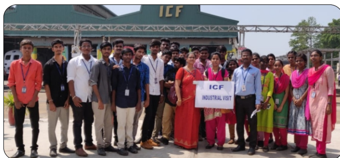
II year UG students' Industrial Visit to ICF, Perambur

The Second Year U.G students (Section-1) of the Dept of EIE visited the Integral Coach Factory (ICF), Perambur, Chennai on 12 th October 2018.