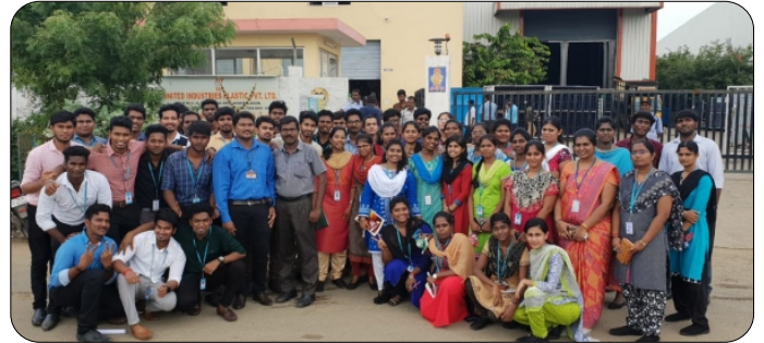
1 Year MBA Industrial visit to M/s. United Industries Plastic Private Ltd, Sriperumbudur