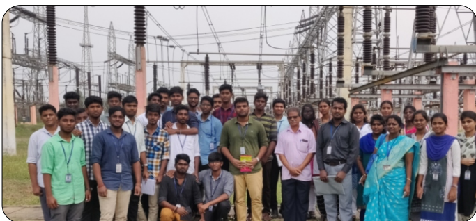
Industrial Visit to 400 kV Substation at Sreeperumputhur

The students of IV EEE 2 visited 400 kV Substation at Sreeperumputhur on 28.12.2018.