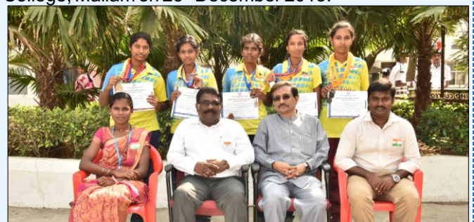
The winners of Cycle Polo & Athletics with Certificates