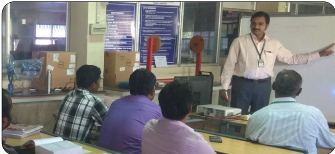
FDP on 'Engineering Mechanics'