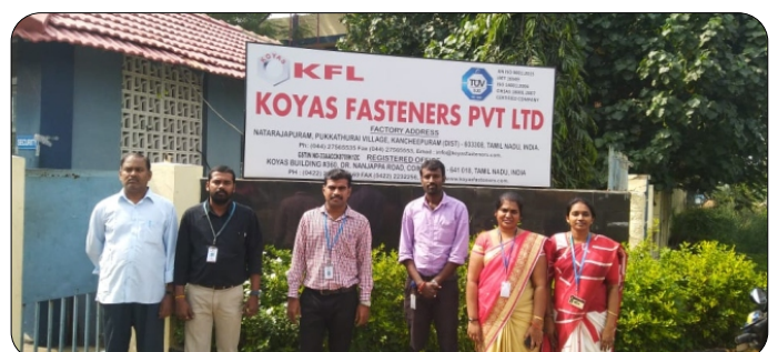
Industrial visit to Koyas Fasteners Private Limited

An industrial visit to Koyas Fasteners Private Limited was organised for the Faculty members of the Dept on 10.12.2018. Faculty members had the opportunity to discover the process in the manufacturing of High Tensile Automobile & Industrial Fasteners.