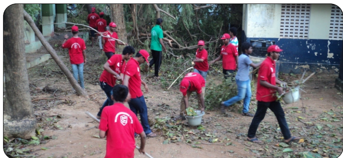
NSS Team on Gaja Cyclone Relief Measures