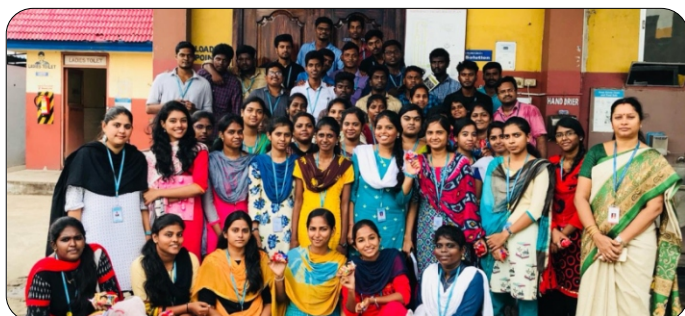
Industrial visit to M/s Modern Bakers Pvt Ltd., (Parle G Plant), Chennai