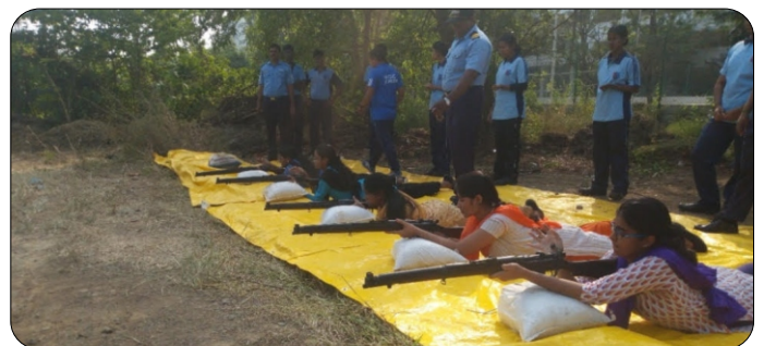
Firing Camp for 500 NCC Cadets at SRM Valliammai Engineering College

The Firing Camp for 500 NCC (National Cadet Corps) was conducted in Small Arm Firing Range at SRM Valliammai Engineering College, from 05.01.2019 to 07.01.2019.