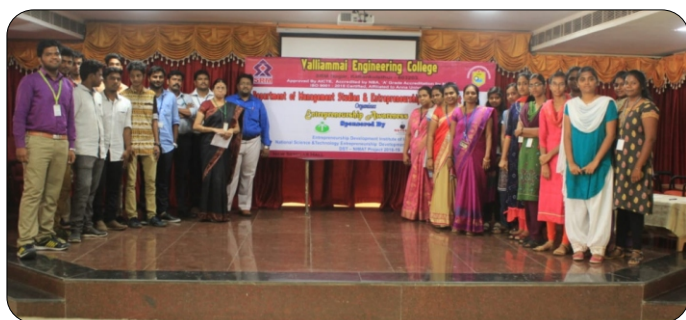
Entrepreneurship Awareness Camp

had the opportunity to have a real time understanding on production operations in a manufacturing set up. On the whole, this Entrepreneurship Awareness Camp focussed not only on creating awareness, but also on motivating the