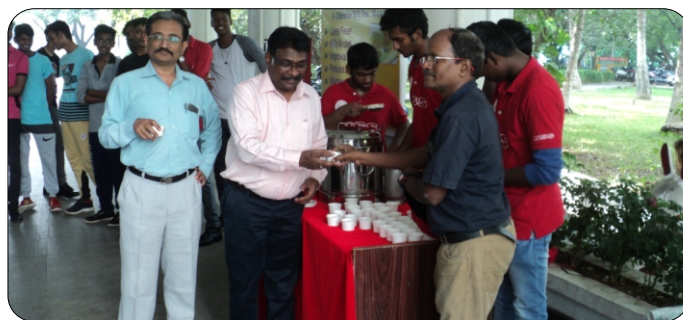
Distribution of 'Nilavembu Kudineer'

With the commencement of Northeast monsoon, the NSS Unit of Valliammai Engineering College organized a cycle of distribution of 'Nilavembu Kudineer' to Faculties, Students, Staff and public. The programme was conducted from 06.12.2018 to 08.12.18 (three days) between 10.00 a.m. and 12.30 p.m. Nearly 500 members were benefited by drinking 'Nilavembu Kudineer'. It was a precautionary measure for the students, staff and public from Dengu and other viral fevers.