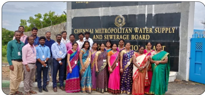
Faculties from EIE, EEE and ECE visited Chennai Metro Water Desalination Plant

Faculty members from the Departments of EIE, EEE and ECE visited Chennai Metro Water Desalination Plant, Nemmeli on 8 th Nov. 2018.